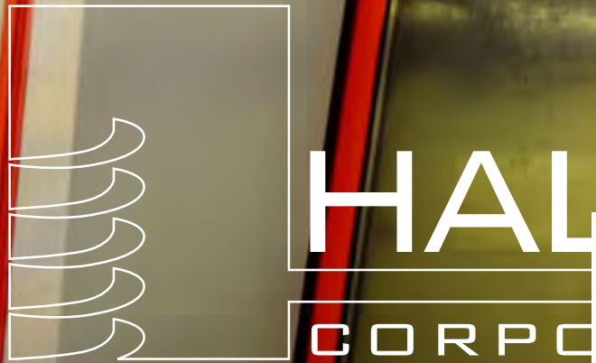
HALTEC CORPORATION USES NUMEROUS STATE-OF-THE-ART AUTOMATIC C&C TURNING MACHINES DURING OUR MANUFACTURING PROCESS.