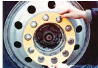
RIM GUARD HX-44