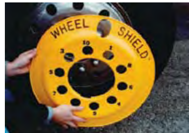
WHEEL SHIELD HX-24

Protection cover for aluminum and chrome bolt hole areas while using an impact wrench.