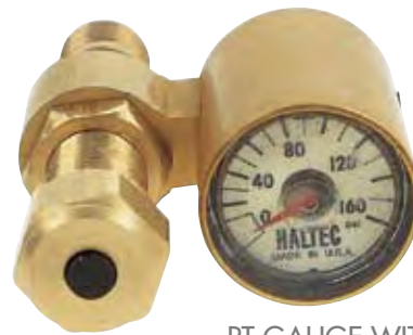
PT GAUGE WITH VALVE

The PT Gauge is liquid filled to prevent damage from vibration.